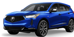
Acura RDX East Liberty, OH