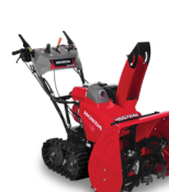
Honda Snow Blowers Swepsonville, NC