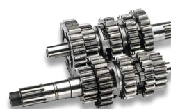
Honda Auto Gear Sets Russells Point, OH