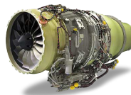
Honda Aero Aircraft Engines Burlington, NC