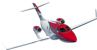
HondaJet Elite II Aircraft Greensboro, NC