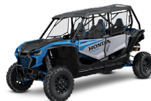
Honda Talon Sport Side-by-Side Timmons ville, SC