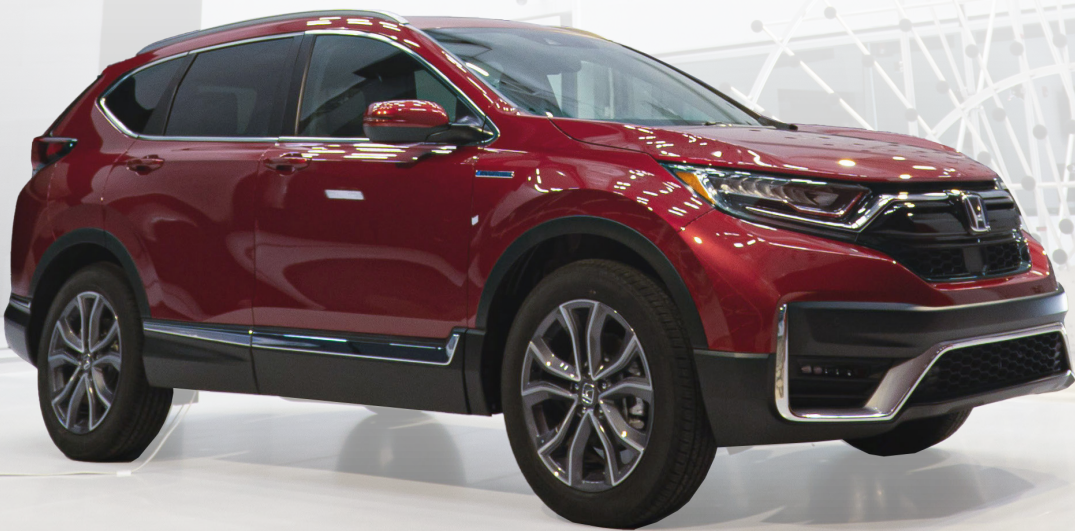
8 Honda engineers created one of the world’s most advanced wind tunnels in East Liberty, Ohio, ushering in a new era of auto development testing capabilities.

Honda’s commitment to Safety for Everyone means protecting not only the driver and passengers in our vehicles, but everyone sharing the road. The advanced active safety and driver-assistive systems in our Honda Sensing® and AcuraWatch™ technologies are now in over 9.5 million vehicles on U.S. roads. These advanced active safety and driver-assistive systems are designed to reduce the frequency and severity of collisions while also serving as a bridge to the more highly automated vehicles of the future.