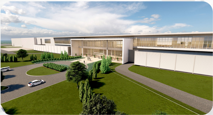
Honda's investment in a new EV battery plant joint venture with LGES is projected to reach up to $4.4 billion and add 2,200 new jobs.

Honda continued its commitment to manufacturing in the U.S. with over $1 billion in new investment to retool three major auto plants in Ohio last year. These operations serve as the foundation for Honda's flexible approach to manufacturing, and will play a critical role in developing the knowledge and expertise for advanced vehicle technology and production to be shared with other Honda plants in America and globally. Production of EVs will begin in Ohio with the all-new Acura RSX, followed by the start of global production of the Honda 0 Series models.