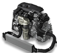
Honda L4 Auto Engines Anna, OH