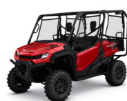
Honda Pioneer Side-by-Side Timmons ville, SC