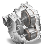
Honda 2-Motor Hybrid System Russells Point, OH