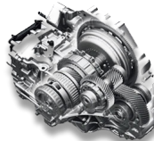
Honda Auto Transmissions Tallapoosa, GA