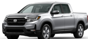
Honda Ridgeline Lincoln, AL