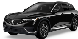
Acura ZDX Spring Hill, TN (GM partnership)