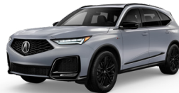
Acura MDX East Liberty, OH