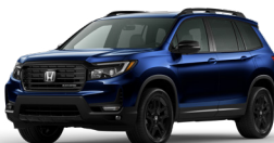
Honda Passport Lincoln, AL