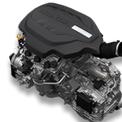
Honda V-6 Auto Engines Lincoln, AL Anna, OH